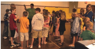
Presentation made to the Hillsboro Church of Christ Children's Ministry.

Call the SOPC to schedule someone to speak to your group.