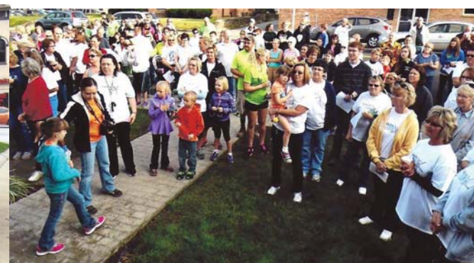
Before the Walk