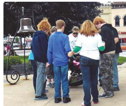
Praying around the Courthouse